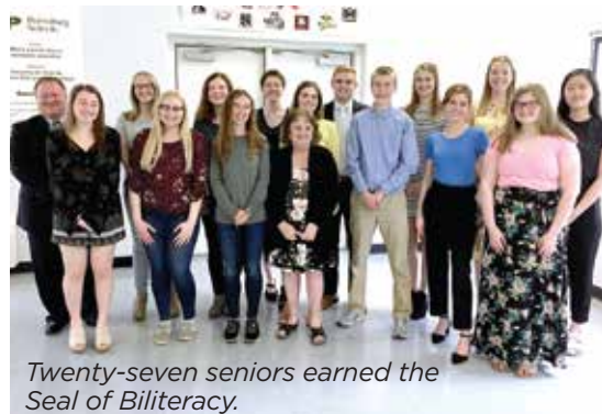
Twenty-seven seniors earned the Seal of Biliteracy.

The Board of Education recognized 27 graduating seniors for earning the Seal of Biliteracy for demonstrating a high level of proficiency in English and one other language. This is the first year for this designation, a rigorous standard for those studying world languages.