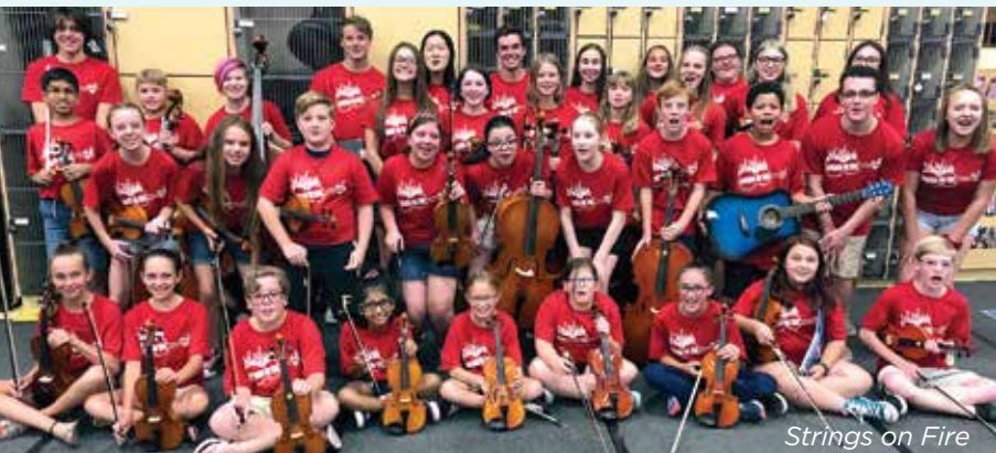
Strings on Fire

The third annual Strings on Fire (SOF) Summer Lesson Program included 50 students in grades 5-8, who took lessons from 14 certified Perrysburg High School student teachers throughout the summer. Violin, viola, cello, bass, piano and guitar lessons were available. The program concluded with students performing a recital for parents, guardians and families. A special thank you to Citizen Advisory Group in Perrysburg for sponsoring the Strings on Fire shirts for a third year.